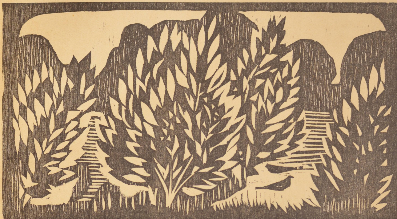
By Nandalal Bose.